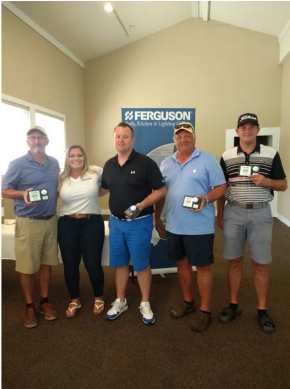
Last Place - Sherwin Williams/No Drip Painting