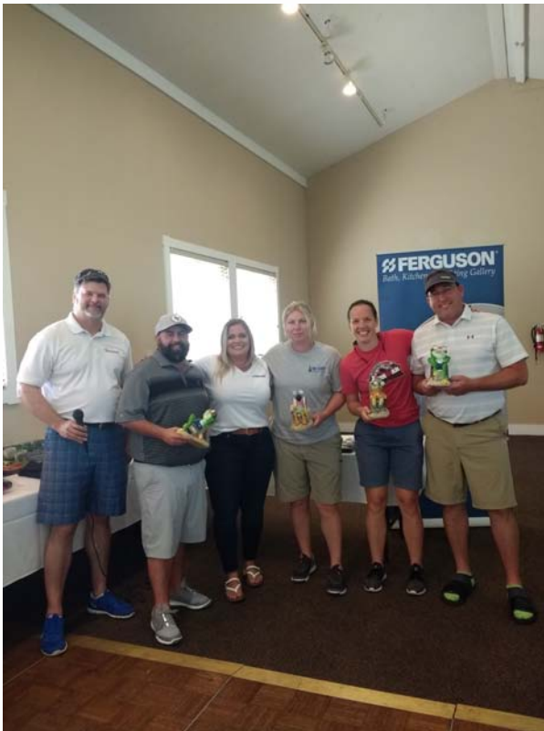
We hope you all enjoyed the Skirt Hole, put on by