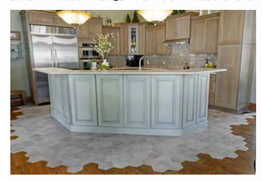
Best of Show