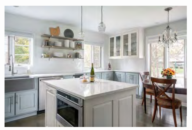
2018 Local CotY Award Recipient

It's never too early to start planning your Contractor of the Year (CotY) entries! Make sure you are taking before and after pictures of your projects.