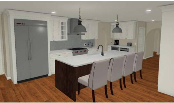
Best Kitchen - The Cleary Company